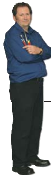
Creative Arts Therapy