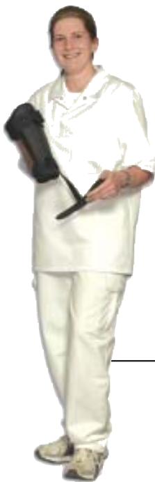
Prosthetics & Orthotics