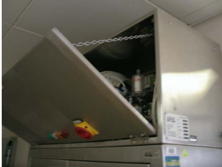
AFOS ESF cabinet