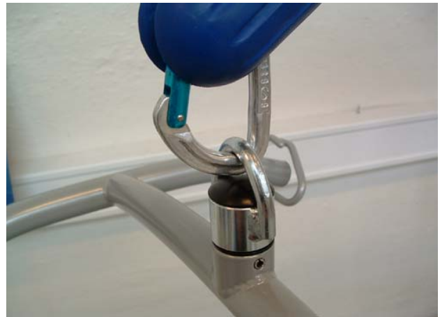
3) New design: Correctly attached spreader bar.