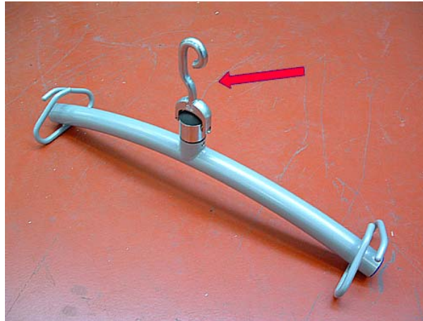
1) Original design: Requires replacement.