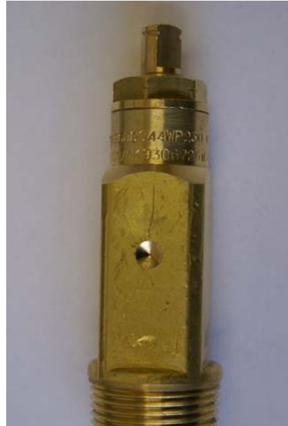
Acceptable key operated valve

Note: the valve has a brass coloured spindle.