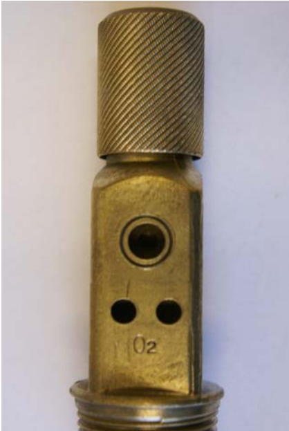
Acceptable thumbwheel valve